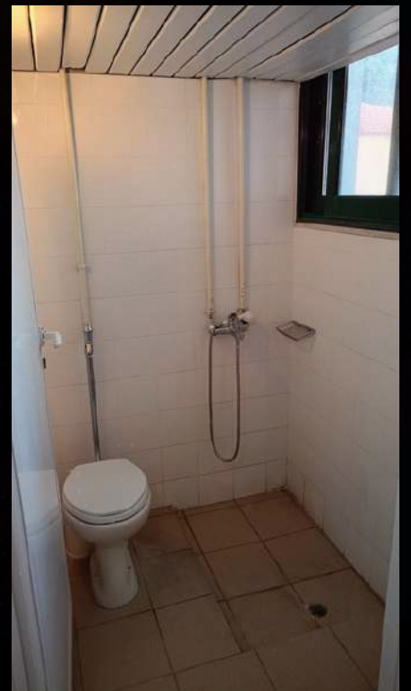
PHOTOS OF ACCOMMODATION